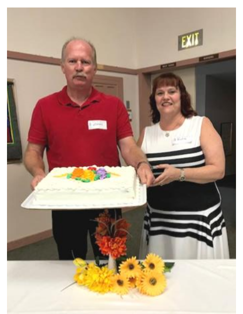
FIRST PRESBYTERIAN CHURCH OF ORANGE