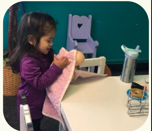
Learning Caring & Kindness