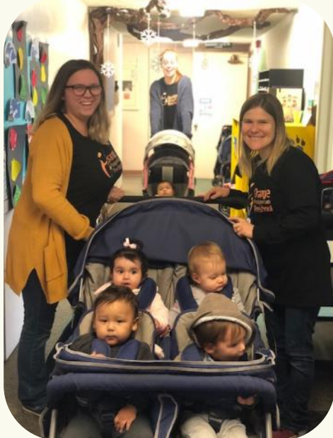
Leaving for a Neighborhood Walk