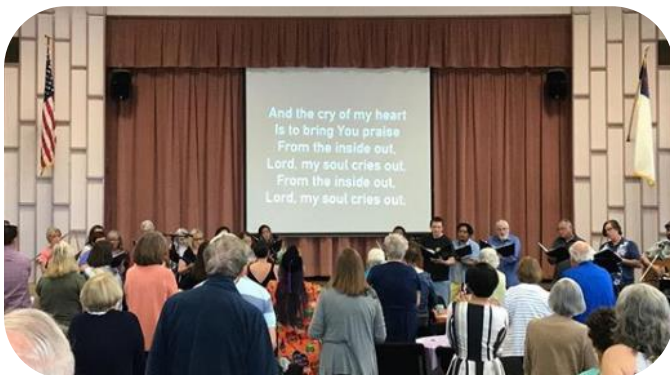
Worship and Picnic event.

The worship committee is grateful for all your acts of service!