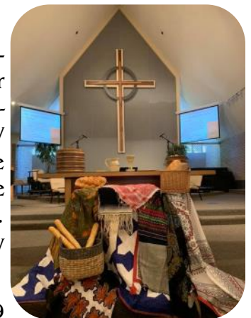
World Communion Sunday featured songs from around the world.

2019 featured several special services throughout the year. Lent and Holy week featured drive-up ashes for Ash Wednesday, an Agape Feast for Maundy Thursday, and a powerful Good Friday Tenebrae service. On October 20th, we all piled into McAulay Hall for a joint contemporary/traditional service with tacos and games afterwards. The Sunday before Christmas featured a very well-attended Christmas pageant from the church youth. We ended the year with a beautiful Christmas Eve service. Thank you to all church members who helped decorate our Sanctuary for Advent and Christmas.