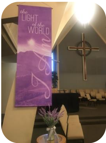
New Lent Decorations.

We currently have twelve actively participating lay liturgists and seven volunteers to lead the children's message. If you would like to join either group, we'd love to hear from you! Reach out to any member of the Worship Committee to get started. We are thankful for all of the volunteers who help make our service possible.