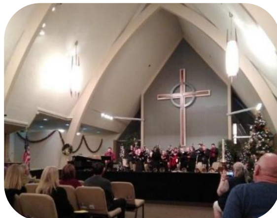
Our Christmas Jazz concert was one of the highlights of the year.