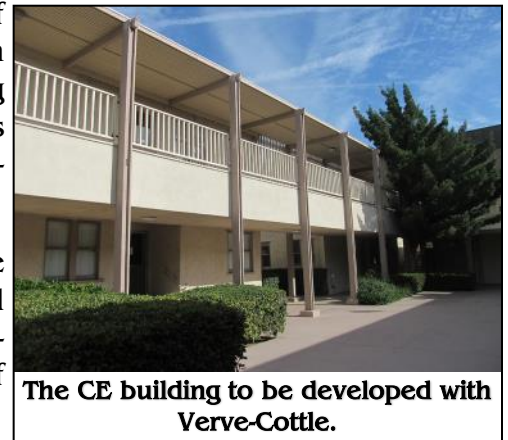
The CE building to be developed with Verve-Cottle.