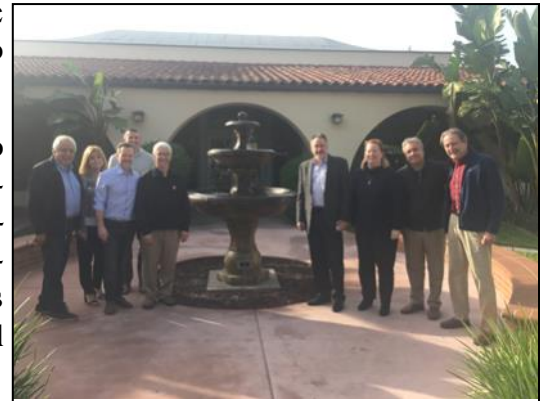
Members of the Church Management Committee with staff from Verve-Cottle on the day that contracts were signed for sale of the GSC and our new Joint Venture for the CE building.