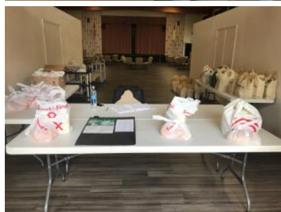
Clockwise from top: We've moved the pantry supplies to McAulay Hall for the timebeing. Citrus generously provided by local church members. Distribution setup to accommodate necessary social-distancing measures.